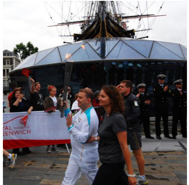
The Paralympic Torch Relay passes the Cutty Sark at Greenwich

With a highly successful Olympic Games complete, our attention turned to the Paralympics. HMS OCEAN was to maintain her presence at Greenwich throughout the period and although her contribution to the Air Security Plan was complete, aviation support to the Maritime Security Plan continued. 3 Lynx Mk8 helicopters of 815 NAS remained to fly in support of the civilian authorities patrolling the Thames. The logistical support also remained with the number of Venue Security Force increased on-board to 450. Members of the Ship's Company were also involved in the Paralympic Torch Relay which left Greenwich Pier by launch and