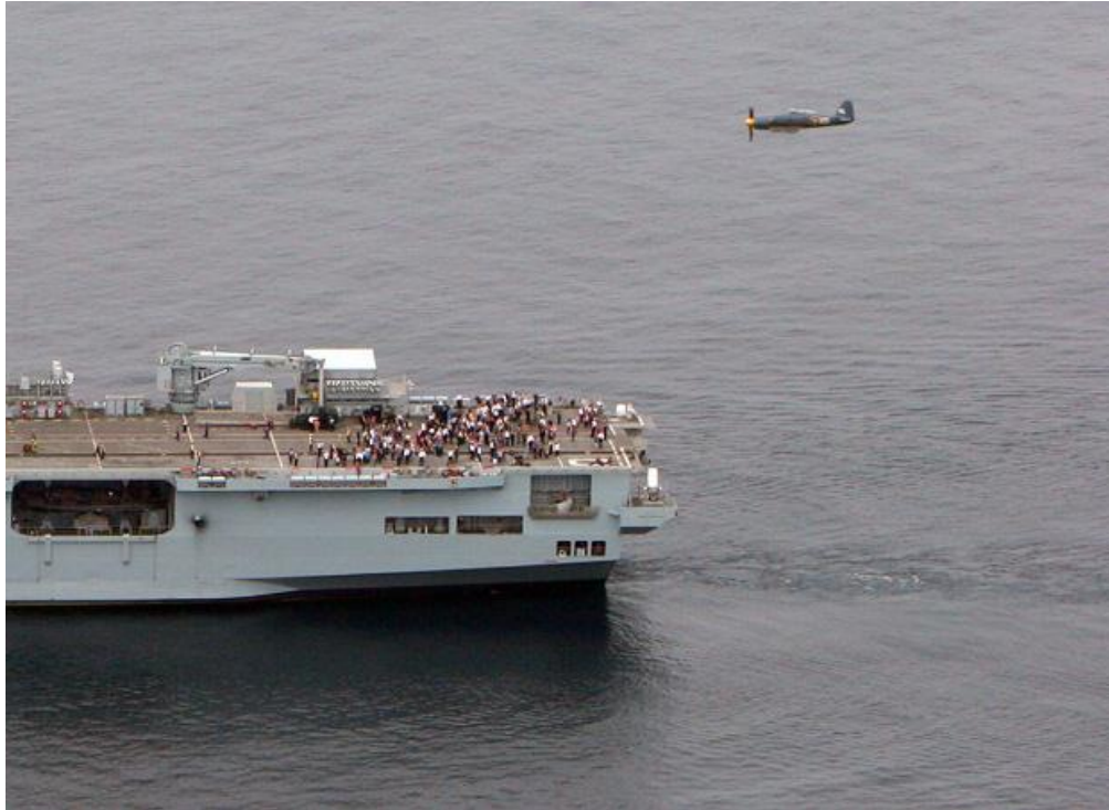
The amazing Sea Fury conducts a Fly-past of HMS OCEAN during Families Day.

On a hazy early summer's morning in June, OCEAN set sail from Plymouth Sound with over 200 family and friends embarked who would witness a very special spectacle. Sixty years ago a Sea Fury aircraft from the previous HMS OCEAN shot down a MIG jet fighter over the skies of Korea, becoming the first propeller driven aircraft ever to have outgunned a jet fighter and so writing itself into naval history. Sixty years on and those present for the Ship's Families Day were treated to an air display by a Sea Fury from the RN Historic Flight based at RNAS Yeovilton in Somerset.