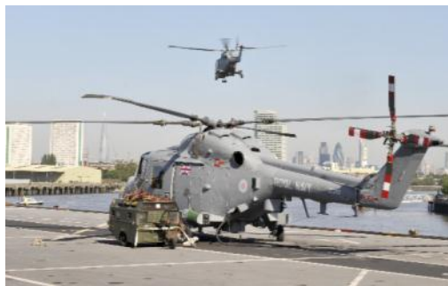
The TAG provide support to Maritime and Air Security

were not in any way compromised. The Logistics Department fed, watered and accommodated the embarked Venue Security Force (VSF) as well as every other soul on board. The VSF itself provided the security to the Greenwich Park Equestrian Venue ensuring the multi-national spectators and participants felt safe and at ease.