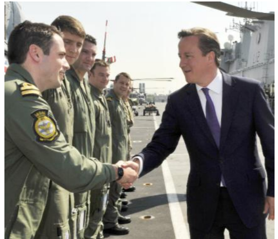
Prime Minister David Cameron meets members of 815 Naval Air Squadron

Piers Morgan and a crew from CNN came to highlight the assistance the military was giving to the civil authorities during the Games.