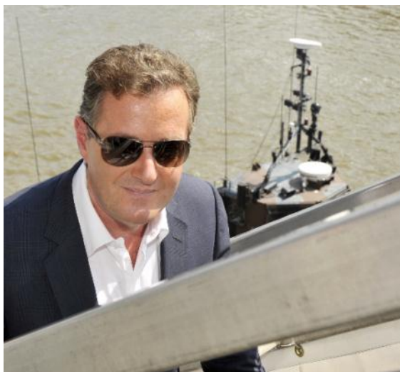
Piers Morgan arrives onboard