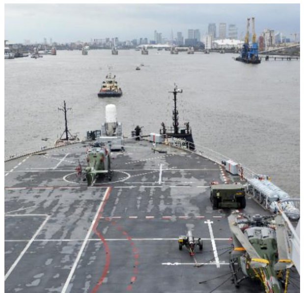
Approaching the Thames Barrier

This was to be home for the next two months and would become an essential hub of activity for a multitude of Olympic tasking.