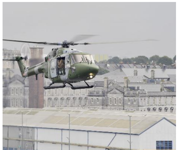
A Lynx Mk 7 of 661 Squadron Army Air Corps embarks prior to sailing in Devonport.

An incredible feeling of anticipation was felt by all, but first OCEAN had a surprise up her sleeve.