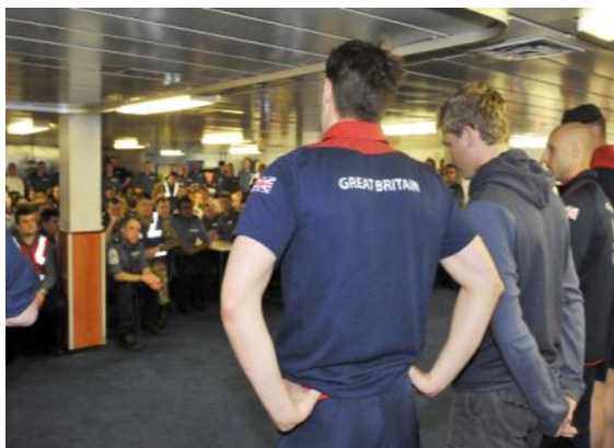
Team GB visit the Team OCEAN