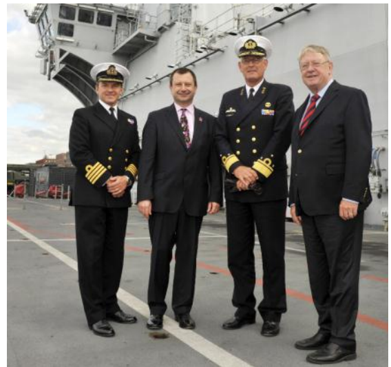
The Minister of Defence of the Kingdom of the Netherlands (far right).