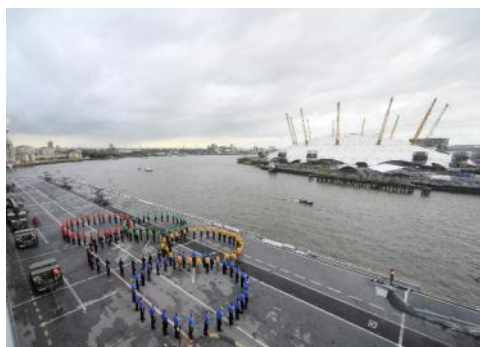
A view of the Rings from FLYCO

First came a team of 30 dressed in black, shortly followed by teams wearing the four subsequent familiar colours of the Olympic Rings. With military timing and precision they assembled