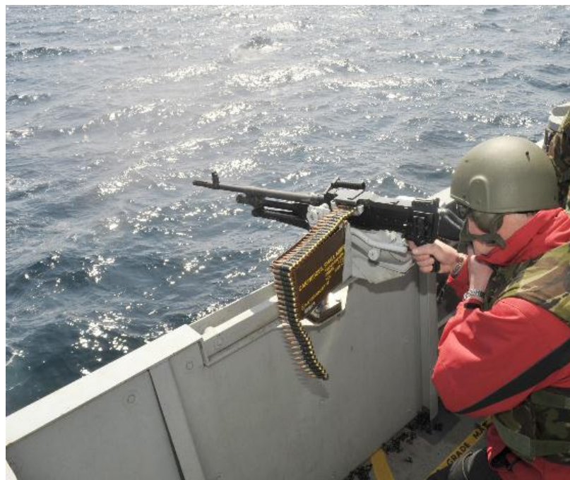
Conducting live firings at sea proved to be very popular

Family members had another opportunity to experience life on board the "Mighty O" at the end of May when the ship conducted another of the highly popular Parents and Children at Sea (PACAS) events. Twenty seven relatives embarked in the Ship's affiliated city of Sunderland and sailed back to Devonport during a week in which they were given the opportunity to take part in a varied programme of Ship's activities.