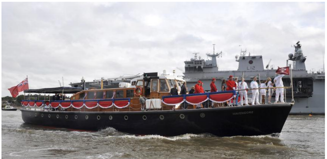
The Paralympic Torch Relay becomes waterborne as it passes the Mighty "O" at Greenwich

A number of the Ship's Company were present at the Opening Ceremony of the Paralympic Games after tickets were made available by LOCOG for them to attend.