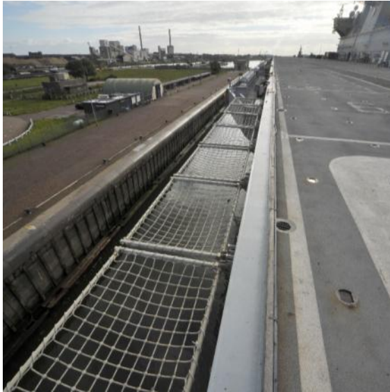
HMS OCEAN squeezes through the lock into Amsterdam

tic opportunity for the Minister to see at first hand just what OCEAN could do.