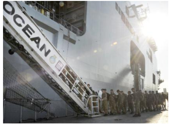
The Venue Security Force Embark

From the moment the Ship arrived at Greenwich it was to play an essential part in the security of the Games. The Tailored Air Group and Air Department supported both the Air Security Plan and Maritime Security Plan; assisting the civil authorities in ensuring both the river and restricted airspace